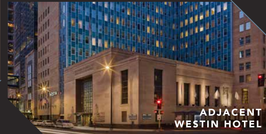
ADJACENT WESTIN HOTEL