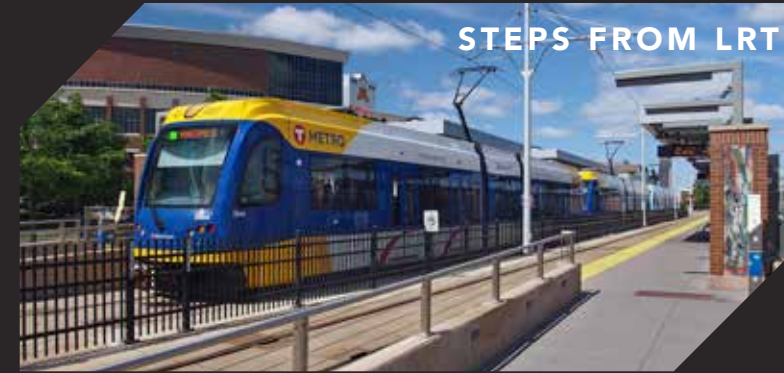
STEPS FROM LRT