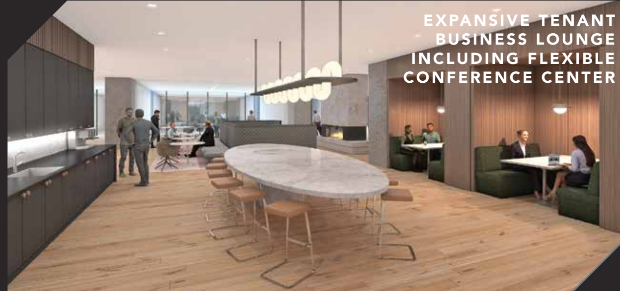
EXPANSIVE TENANT BUSINESS LOUNGE INCLUDING FLEXIBLE CONFERENCE CENTER